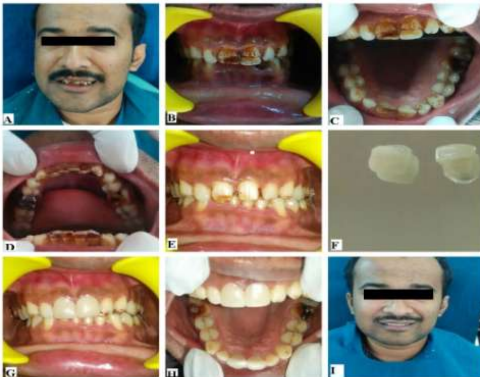
Figure 2 – A) Preoperative extra oral frontal view with intrinsic stains, B) Preoperative intraoral frontal view, C) Preoperative intraoral maxillary occlusal view, D) Intraoral mandibular occlusal view, E) Tooth preparation of 11, 21, F) emax crowns, G) Postoperative intraoral frontal view, H) Postoperative intraoral maxillary occlusal view, I) Postoperative extraoral frontal view.