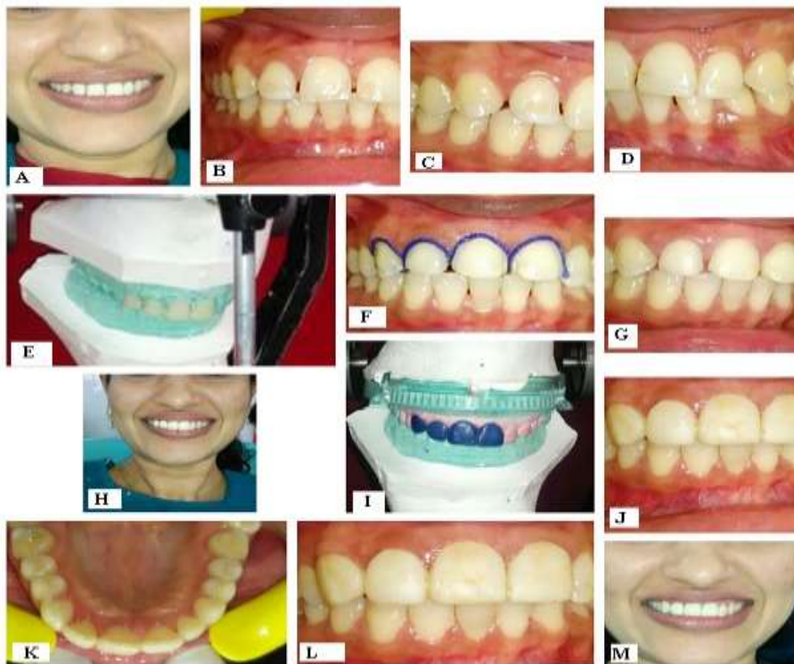
Figure 1 – A) Preoperative extraoral frontal view, B) Preoperative intraoral frontal view, C) Preoperative intraoral right lateral view, D) Preoperative intraoral left lateral view, E) Mock up on cast, F) Tooth preparation and gingival retraction, G) Chamfer finish line w.r.t. 11,12,13,21 H) Temporization, I) Wax pattern, J) Postoperative intraoral frontal view, K) Postoperative intraoral maxillary occlusal view, L) Postoperative intraoral right lateral view, M) Postoperative extraoral frontal view.