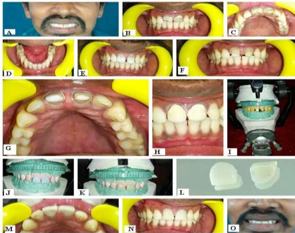
Figure 3 – A) Preoperative extraoral frontal view, B) Preoperative intraoral frontal view after the dislodged PFM crown, C) Preoperative intraoral maxillary occlusal view, D) Intraoral mandibular occlusal view, E) Core buildup of 11,21, F) Tooth preparation with shoulder finish line of 11,21, G) Tooth preparation-maxillary occlusal view, H) Temporization, I) Cast with die cutting of 11,21, J) Wax pattern fabrication, K) emax crowns on the cast, L) emax crowns stained and glazed, M) Postoperative intraoral maxillary occlusal view, N) Postoperative intraoral frontal view, O) Postoperative extraoral frontal view.